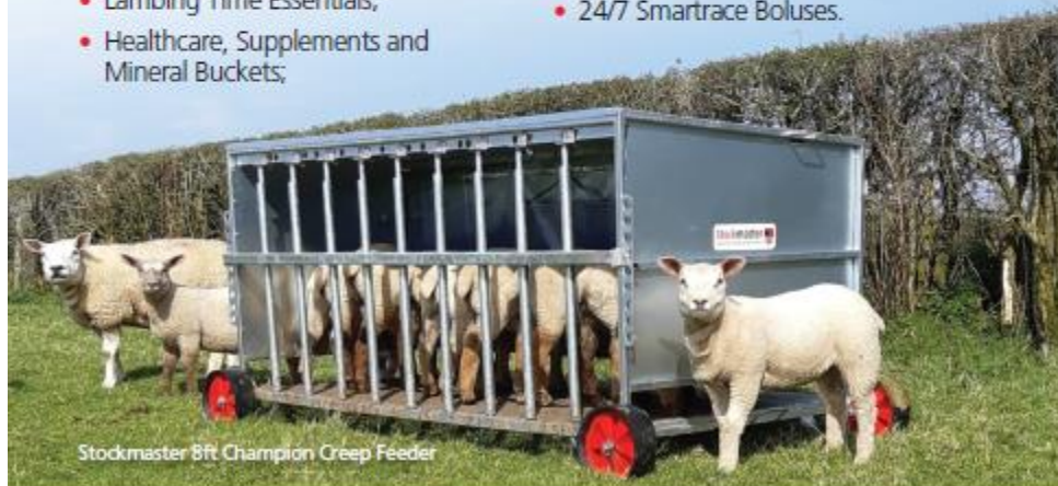
Stockmaster 8ft Champion Creep Feeder

Global Building, 8 Steeple Industrial Estate, Antrim, Co. Antrim, BT41 1AB Telephone: 028 9083 1647 Email: Info@stockmasteragri.com